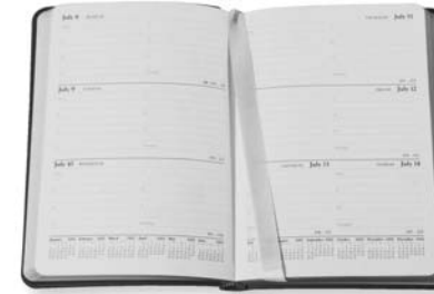
WEEKLY JOURNAL week-at-a-view STYLE WJL , 5 1/2" x 8", 320 pages $60.00