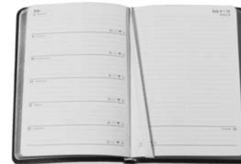
2005 NOTEBOOK the week plus notes Recreational travel information US festivals and events STYLE WJ7 , 5 3/8" x 7 3/8", 224 pages $50.00