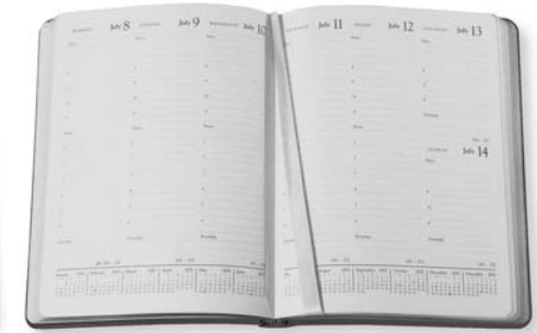
DESK DIARY week-at-a-view STYLE DDV , 7" x 9 1/4", 240 pages $65.00