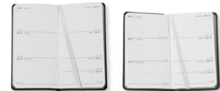
5" PERSONAL POCKET JOURNAL STYLE PJ5 , 3" x 5", 156 pages $24.00