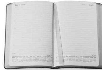
DAILY JOURNAL day-to-a-page STYLE AJL , 5 1/2" x 8", 416 pages $60.00